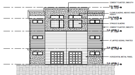
REAR BY PLANTING