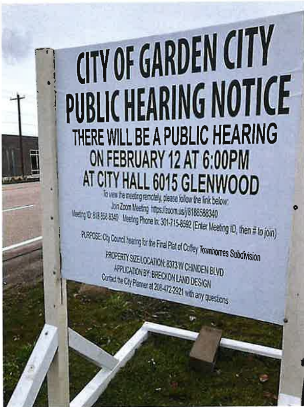
Chinden Blvd – view to East