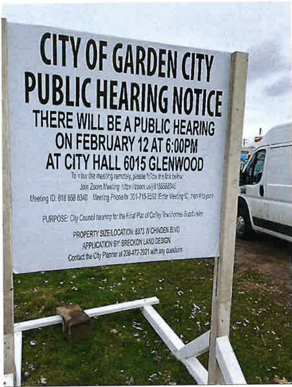
Coffey Street – view to North