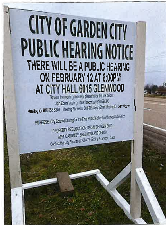
Chinden Blvd – view to West