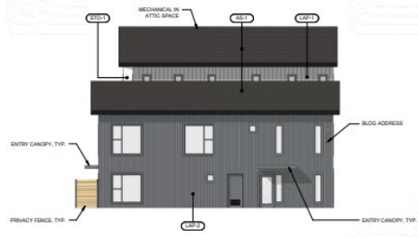
2 bldg A - office 1/8" = 1'-0"