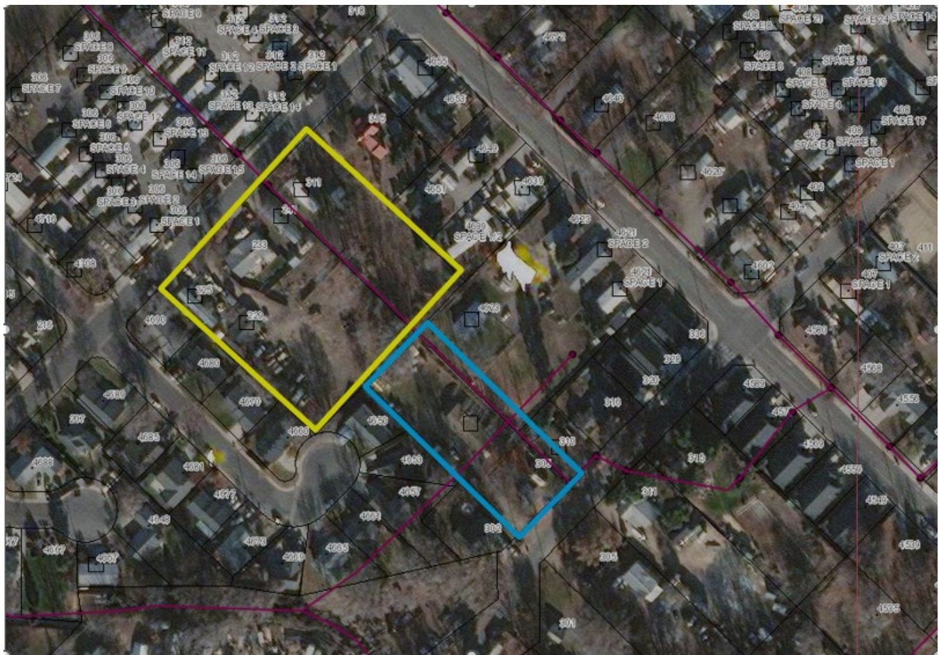
Figure 1: Fairview Acres Irrigation - Open Canal