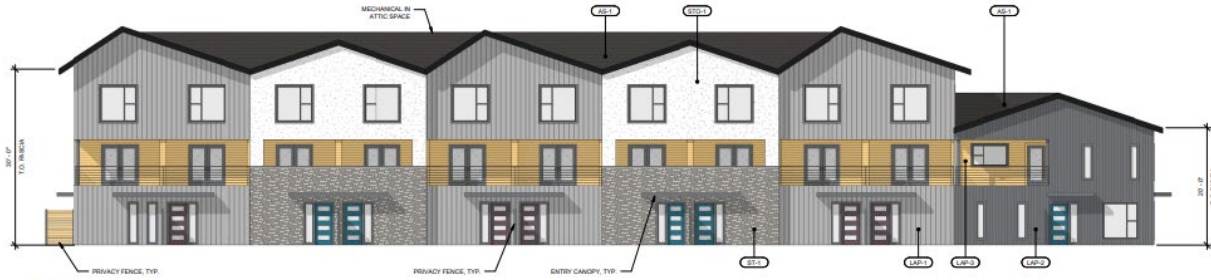
1 bldg A - entry 1/8" = 1'-0"

File Number: DSRFY2022 - 0022 Application Scope: Formal Hearing Location: 233 & 311 E. 47 th Street Applicant: Katrina Klum Pre-Application Report Date: September 8, 2022 Formal Hearing Date: February 6, 2023