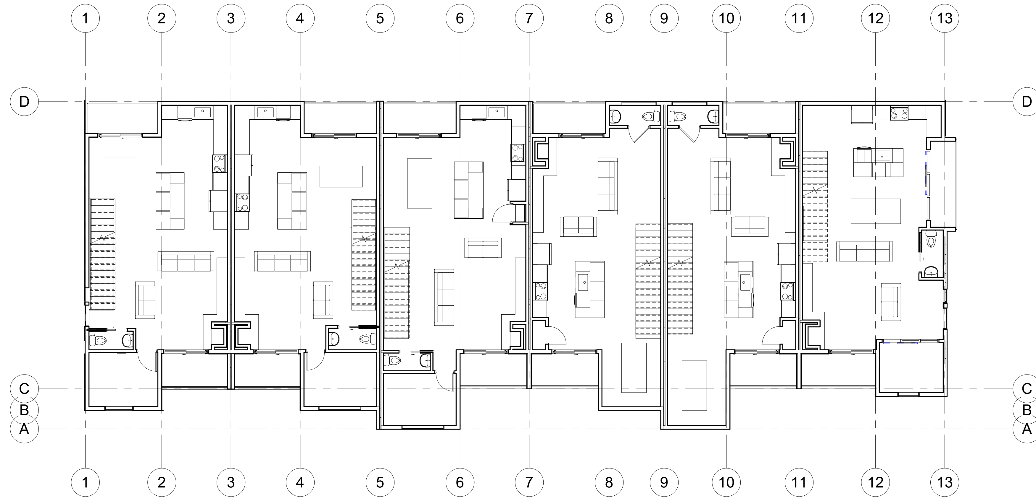
2 Level 2 1/8" = 1'-0"