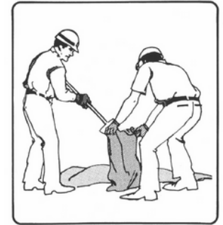
HOW TO FILL A SANDBAG

Sandbags are intended to defend homes and structures in their immediate vicinity. Sandbags are not intended to prevent water from coming onto property lines or to be placed in yards or city streets – this may divert water onto a neighbor’s property or other important areas.